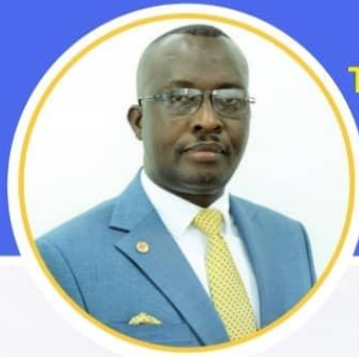
CHIEF GUEST: Hon. John Mulimba (MP) Minister of State for Foreign Affairs (Regional Affairs)

TOPIC: It Matters How We Open Knowledge: Challenging Established Norms